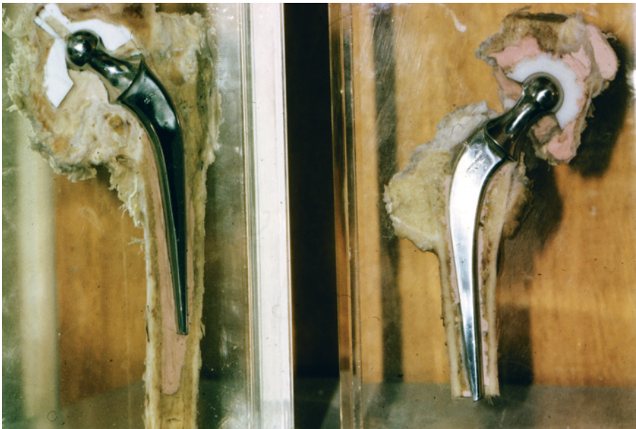
Figure 4 Two samples from autopsies. On the left, a Teflon acetabular cup worn out after some years of use. Note vertical direction of wear track. On the right, the future-oriented prosthesis with an acetabular cup made of ultra-high molecular-weight polyethylene first used by Charnley in 1962. The picture was taken in 1967 when Sudmann visited Charnley.

implanted once or even twice in the same hip in other hospitals. Later they would come to the Coastal Hospital to have it replaced by a Charnley prosthesis. To produce the evidence that could stop this unfortunate practice, a follow-up study was made of the patients who had been included