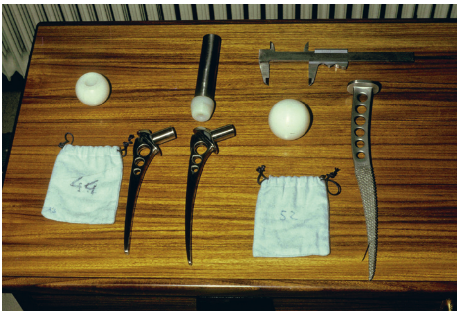
Figure 2 Christiansen's hemiprosthesis in 1967. Femoral heads made of polyethylene, diameter 44 mm and 52 mm, without a steel coating. Stems of varying sizes, a file and a punch to drive them into the femoral shaft. During the surgery, a sterile slide caliper was needed to find the diameter of the caput femoris that had been removed by the surgeon.

Christiansen's patents not only included a trunnion and a trunnion bearing, but also a fully cast prosthesis stem with a small caput, similar to Charnley's ball-and-socket