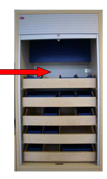
Figure 4 Example of cupboard for storing medical supplies. Note the internal cupboard for Class A and B medication with separate lock

2) Prescription group A (narcotics) and group B (tranquilizers, barbiturates etc.) shall according to Norwegian legislation be kept in a separate locked cupboard, preferably within the locked cupboard for medicines. A notification should be posted stating the content and the procedure for legal access. Be aware that legal drug classification and prescribing legislation differs between countries.