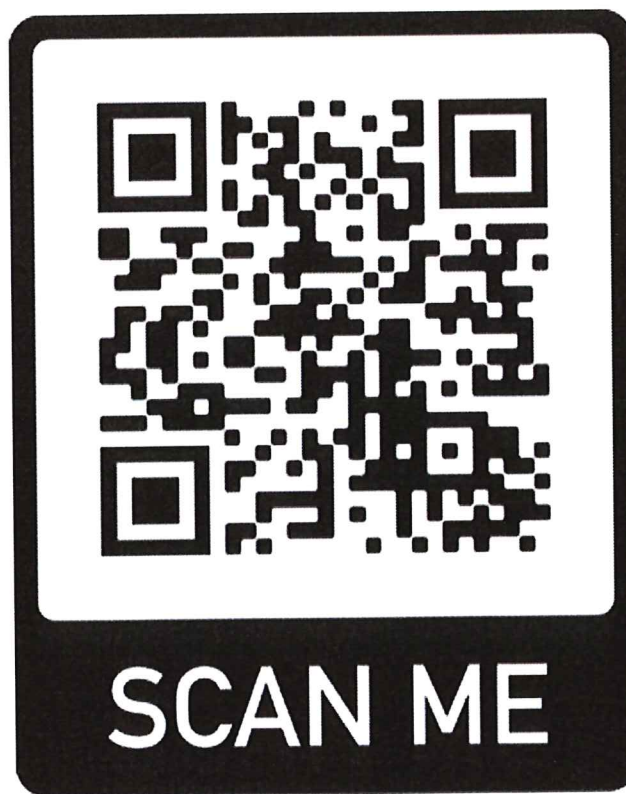
Fig. 3. QR Code for 2-year subjective failure point-of-care risk stratification at the time of primary ACL reconstruction. ACL, anterior cruciate ligament.

The primary outcome of the subjective failure of ACL reconstruction was defined as a KOOS QoL score of <44. Other possible measures of subjective outcome include, but are not limited to, the minimal clinically important difference (MCID) or Patient Acceptable Symptom State and may use other assessment tools such as a visual analogue scale or the International Knee Documentation Committee questionnaire. While there are advantages and disadvantages to each measure of functional outcome, KOOS QoL was selected for this study since it has previously been validated as a measure of inadequate knee function associated with prospective ACL reconstructed graft failure and represents a poor outcome after surgery [11]. Further, the prevalence of a KOOS QoL score of <44 was 22%, which suggests that the outcome is clinically relevant across the population.